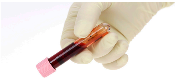
Figure 2: Turning the tubes upside down and back is one full inversion.

The FC Mix additive is a powder which ensures that there is no dilution effect due to any liquid, but it does require thorough mixing. Ten full inversions are needed to mix the additive with the patient's blood sample right after collection. This is an important step that supports full functionality of all ingredients. 15